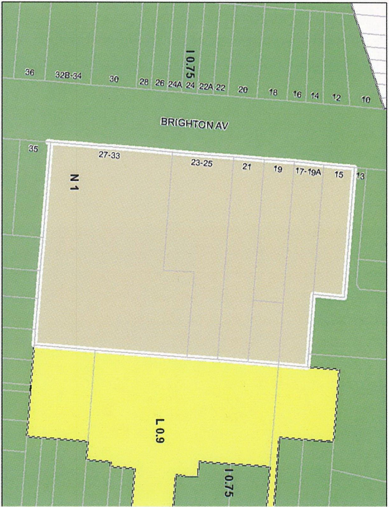
Map 3: Existing Floor Space Ratio (FSR)