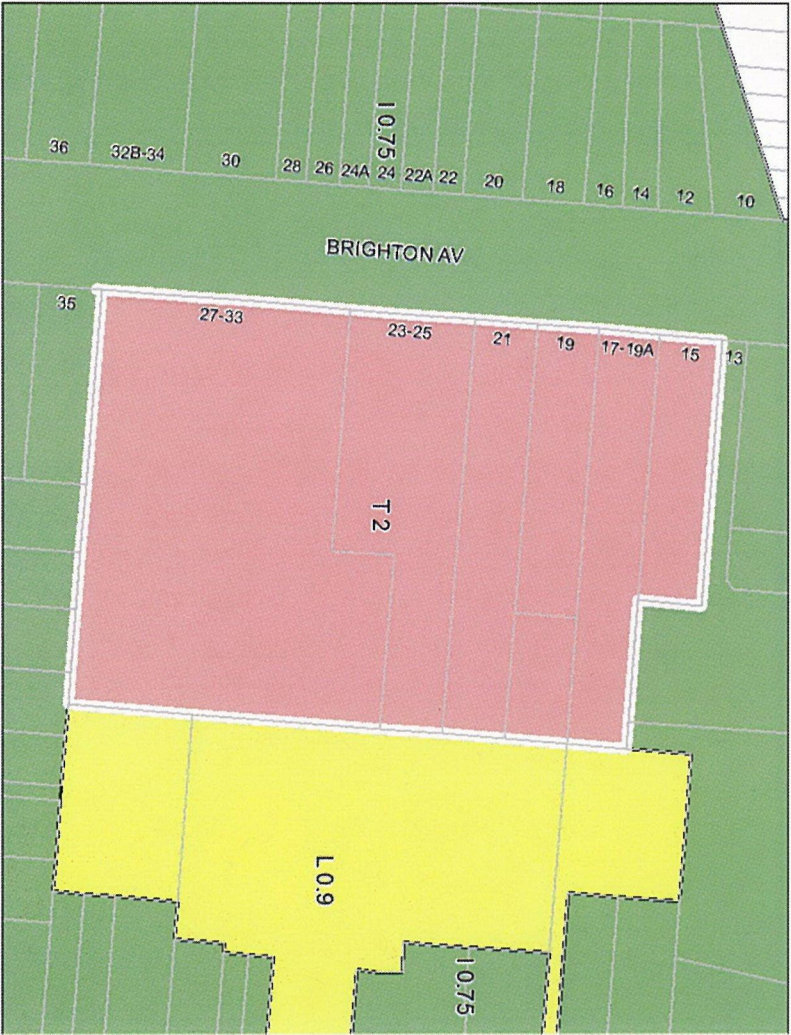
Map 4: Proposed Floor Space Ratio (FSR)